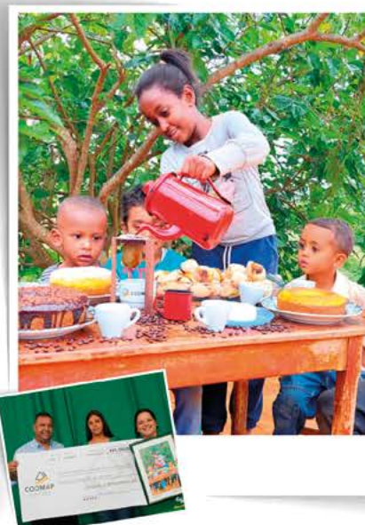
And this year's big winner is:

She also added a description to her photo: Without the worker it is impossible to bring coffee to the table! Here we manual coffee winnowing. And in order to make the photo even more beautiful, we've got that incredible sunset. By the way, the climate makes all the difference for a good crop development.